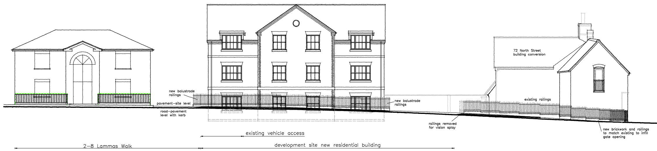
PROPOSED STREET VIEW