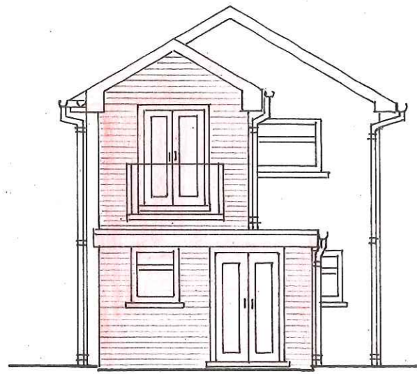
proposed rear elevation