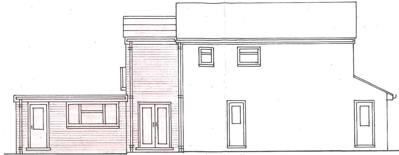
proposed side elevation